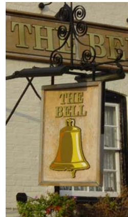
THE PUB IN THE BURY

Community halls, restaurants, churches and pubs are vital to the life of the parish and provide opportunities for people to gather, often in historic buildings designed or adapted for the purpose. Such premises make a tangible contribution to the social cohesion of village life, and in that sense are irreplaceable