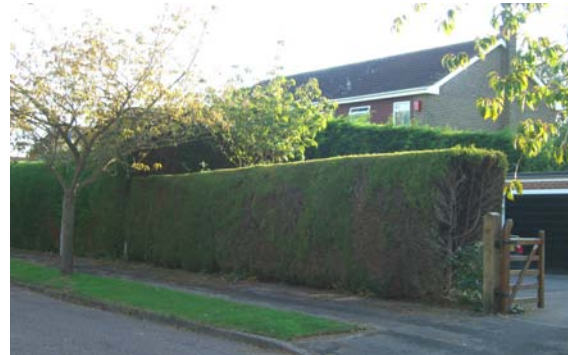
ESTABLISHED HEDGES: ARCHERY FIELDS

A number of courtyard developments and some estates built in the 60s and 70s still recall the original concept of front lawns without boundary structures. However, many owners succumb to the temptation to erect high hedges, which may work for the householder, but often detracts from the general appearance.