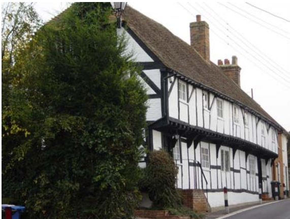
KING STREET JETTIED HOUSES

Further up King Street on the east side is a 16 th century half timbered house with a jettied upper floor and two later adjoining cottages. At the southern end of the terrace, some uncharacteristic white painted brickwork with black timbers may relate to problems of porous bricks and damp penetration.