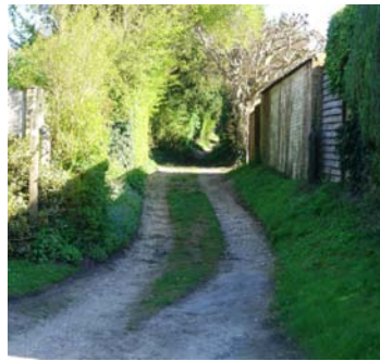
FOOTPATH TO SCHOOL

The rural footpath network, complementing roads throughout the parish, is extensive and well-used. Proposals that introduce or improve access by means other than by car can only be beneficial.