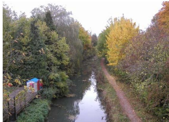
THE CANAL FROM SWAN BRIDGE

The Basingstoke Canal, traversing the Parish from east to west, has been cited elsewhere as a valuable feature. The well-used towpath acts as an important thoroughfare linking North Warnborough, Odiham and Broad Oak. Visually, the canal provides an important linear gap; sometimes at the edge of a settlement, or with trees on one side and fields on the other.