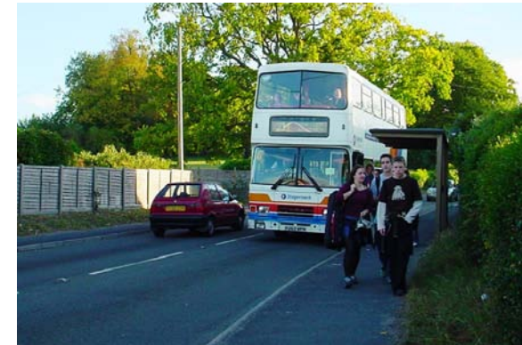
BUS SERVICE ON THE ALTON ROAD

Traffic and parking represent a problem where it represents risk or obstruction, where it creates noise and pollution, and where it is visually intrusive. Shortage of parking is detrimental to day to day activity, particularly retail trade, and leads to dysfunctional parking on roads or in places that are unsuitable. This can be seen where occupants of historic terraces have cars that their predecessors lacked and, more avoidably, in new developments where there is inadequate provision. Large detached houses genera have adequate parking whereas smaller dwellings often do not; this is unsatisfactory.