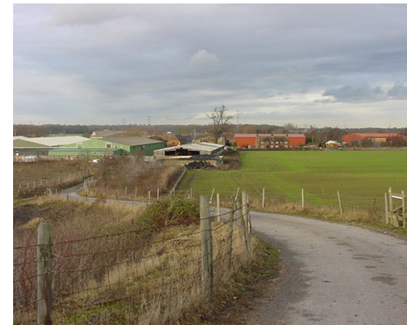
LARGE BUILDINGS AT LODGE FARM

Large buildings in the countryside occur at RAF Odiham and Lodge Farm. It is very noticeable how their impact can be reduced by design considerations, particularly the use of appropriate colour, shape and matt finishes. It follows that such considerations should be strictly enforced in any consent for large buildings, avoiding brash and discordant design, materials and colours that degrade views and appearance.