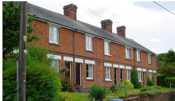
TILLY'S COTTAGES, THE STREET

The buildings along The Street are mostly two storey detached cottages and houses from every century since the 14th, but modern infilling too often gives a cramped appearance and restricts distant views. Visual integrity is also compromised by on-road parking and heavy traffic.