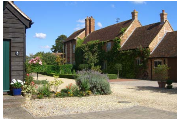
PALACE GATE FARM

To the north of the Cross Barn is Palace Gate Farm. This is a small residential development incorporating original farm buildings converted to residential use. Some new houses have been designed to fit in with the original farmyard concept, and as such work well.