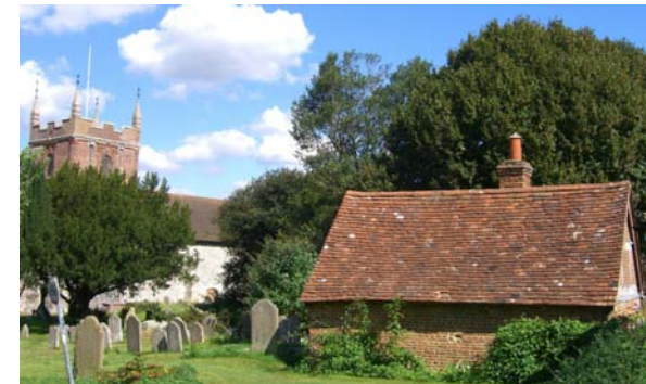
ALL SAINTS CHURCH AND PEST HOUSE

The large Parish Church is situated on the chalk slope rising to the south and sits comfortably in a typical churchyard setting. It is very plain and simple, with a square red brick tower. The main walls are of knapped flint with stone trims and dressings, but were once rendered.