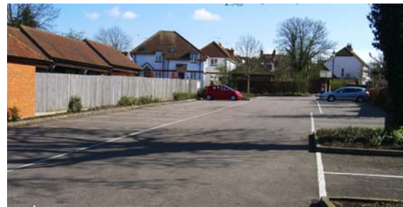
CAR PARK MID AFTERNOON

However, cars and road use also have a major impact on the sustainability of a village and its visual appearance, and good design is essential to make this impact positive or minimal. Such design must accommodate car use where this supports rather than undermines the character, prosperity and quality of parish life.