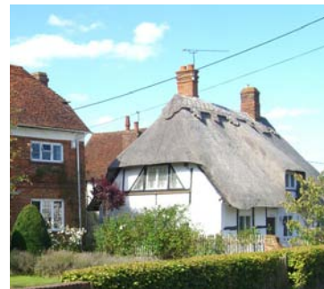
CRUCK HOUSE, THE STREET

There is a pleasing red brick Victorian terrace of former farm workers' cottages, some thatch and an early C14 th half-timbered cruck-house on the south side.