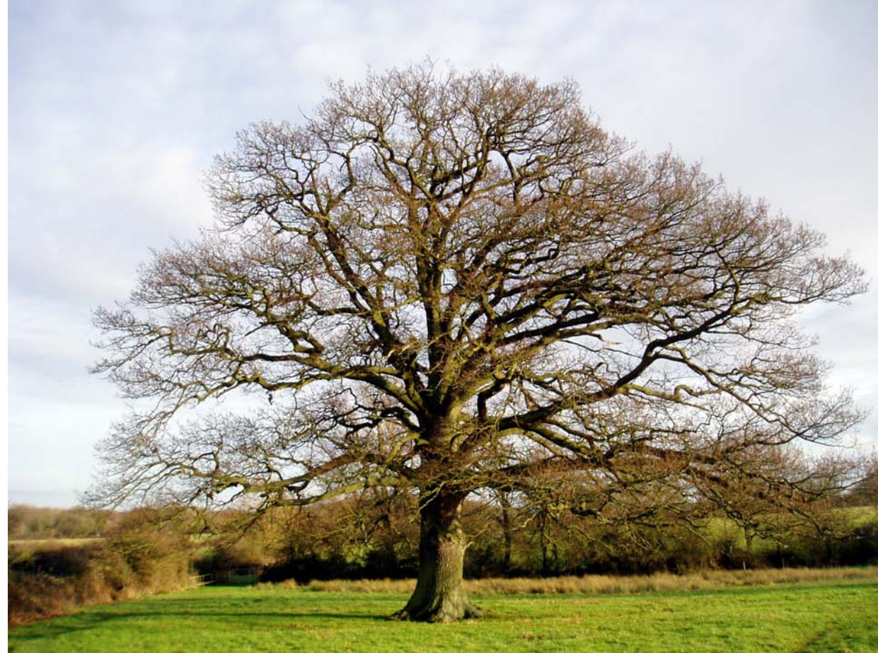
CLASSIC OAK AT HATCHWOOD

The importance of trees and hedgerows is reflected in varying levels of protection, on which further information is available from the Local Planning Authority.