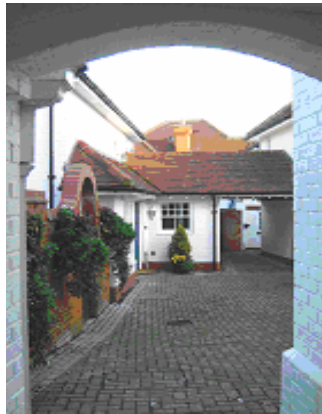
RED LION MEWS

Red Lion Mews built in 2003, is an integrated complex of houses accessed by a central walkway running north from the High Street. The scheme is generally more successful towards the High Street, but less so towards car-ports at the northern end where some houses appear over-designed.