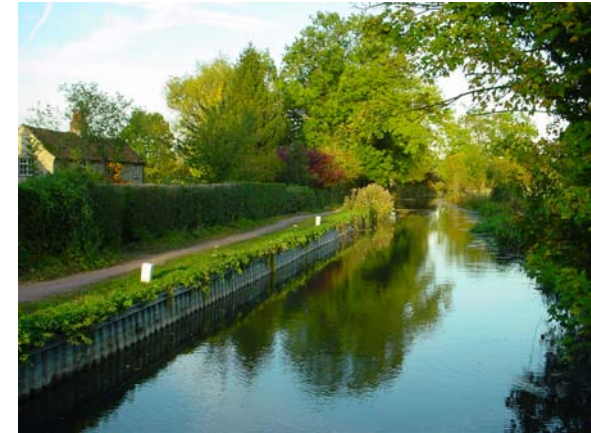
BASINGSTOKE CANAL AT NORTH WARNBOROUGH

The Basingstoke Canal and River Whitewater cross paths towards the west of the parish. Both are important, but very different, waterways. These and the many streams passing under the