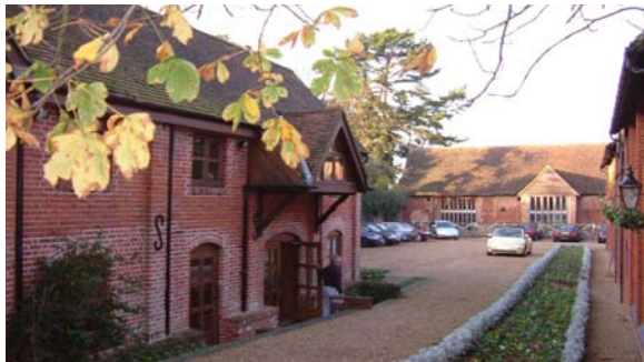
BUSINESS PREMISES AND THE CROSS BARN

Towards the western end of the High Street the land falls away to the north, where a late 1980s office-conversion of barns with some new buildings fits in well with this less built-up part of the village.