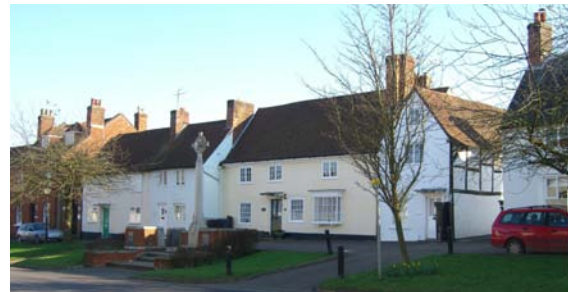
HIGH STREET: WAR MEMORIAL

The eastern end of the High Street widens near the junction with the London Road. Buildings are generally smaller in scale and are mostly residential. On the south side, individual houses form a terrace, set above the road, behind a deep sloping verge; this incorporates the war memorial between the road and the footpath.