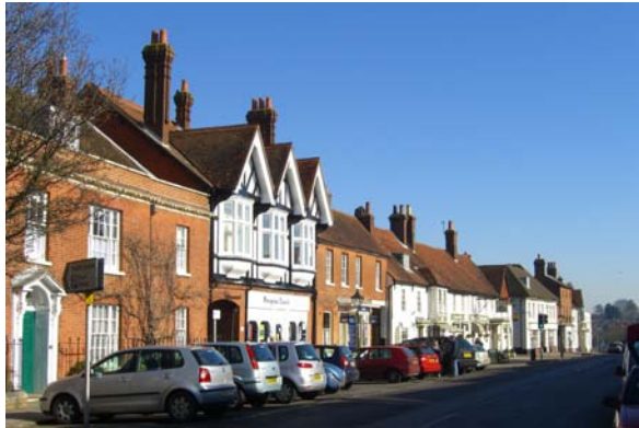
HIGH STREET IN WINTER SUN

Primarily due to the use of a limited palette of local materials, and despite a large variety of building sizes and heights, the High Street forms a satisfying and coherent visual entity with an overall sense of a red and white theme.