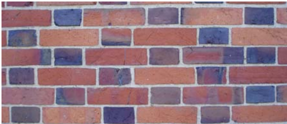
BRICK WALL FLEMISH BOND

Until the second half of the 20 th century, roofs were either tiled or slated with natural materials. Tiled roofs were steeper than 45% and covered with local reddish-brown plain tiles. The tiles were double cambered, being slightly bowed in both their length and their width and usually have a textured surface. Interspersed with plain tiled roofs during the last two hundred years or so, roofs of imported natural slate have been laid to much lower pitches.