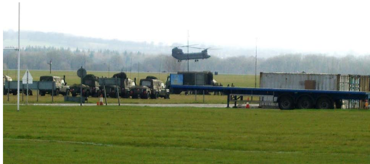
ROYAL AIR FORCE ODIHAM