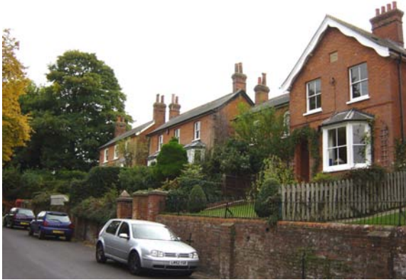
KING STREET VICTORIAN HOUSES

Further up King Street on the east side is a 16 th century half timbered house with a jettied upper floor and two later adjoining cottages. At the southern end of the terrace, some uncharacteristic white painted brickwork with black timbers may relate to problems of porous bricks and damp penetration.