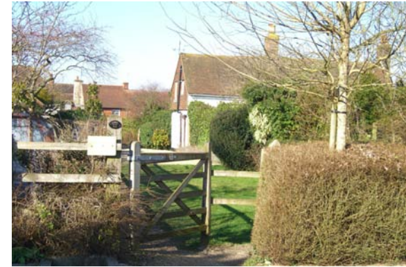
PUBLIC PATH TO HIGH STREET

The layout of some post-war developments sought to offer a sense of open space through large gardens, but subsequent fences, high hedges and large extensions often detract.