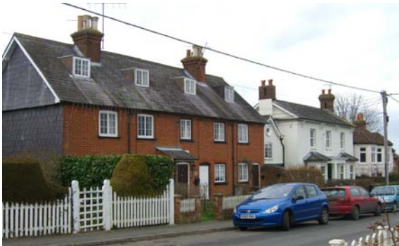
COLT HILL, MAYS MODEL COTTAGES

Most of the buildings along the length of the road are dissimilar, with older development making good use of local materials. Although the houses are generally unremarkable there are several interesting 19 th century properties.