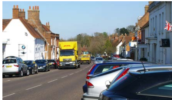
HIGH STREET: MID AFTERNOON

Odiham is a rural Parish where most people need to travel; for work or to shop or to join in social activities and recreation. Vehicular transport sustains commercial and community life, and a car is viewed as a necessity by nearly everyone.