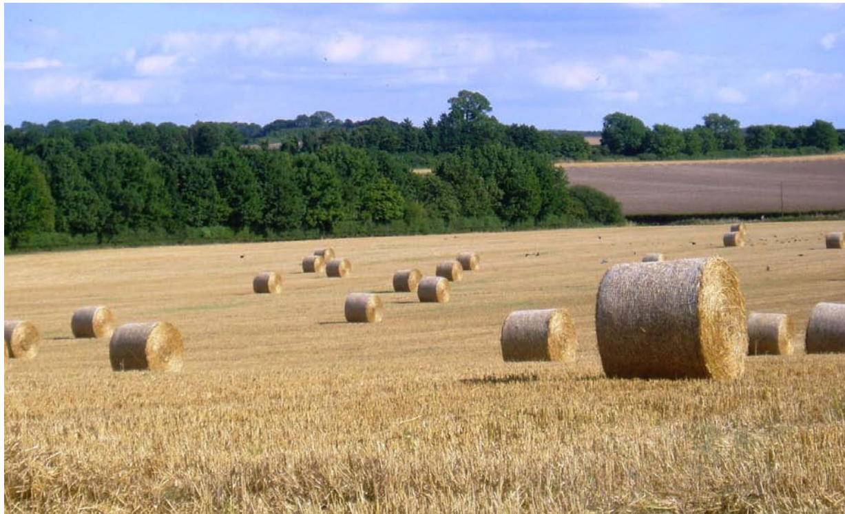
FARMLAND AT HILLSIDE

geology is chalk, with extensive areas of arable cultivation. Pockets of unimproved grassland remain on farms to the south, with some semi-improved grassland at Broad Oak. Such areas have been designated as of importance for nature conservation. Other farmland conservation areas include pasture woodland at Wilk's Water and downland at Horsedown Common. RAF Odiham retains areas of un-improved chalk downland, together with its associated flora and fauna.