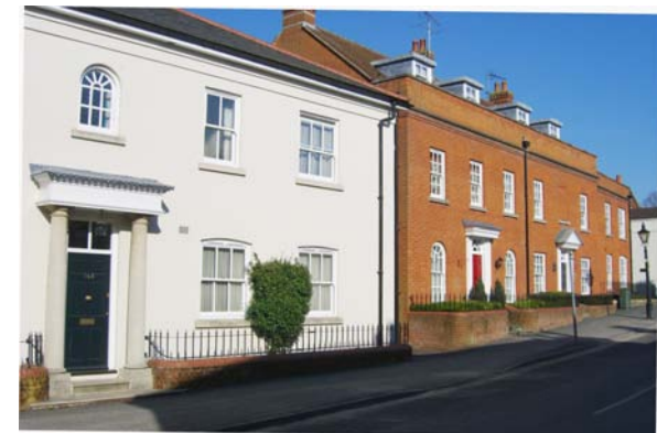
HIGH STREET: MODERN HOUSES

One building has parapet gutters and another has overhanging eaves; reflecting the variety of adjacent buildings. This is an example of a new development blending into the main street and making a positive contribution to the visual environment.