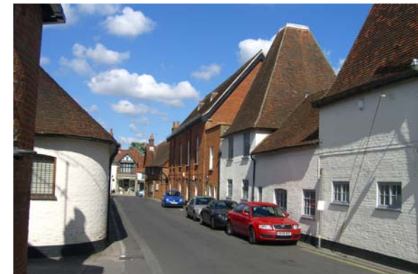
KING STREET LOOKING NORTH

King Street leads uphill south from the High Street, with side streets to the west into the Bury and, further on, into Buryfields.