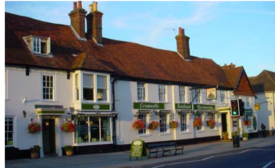
THE GEORGE HOTEL

Along the central section of the High Street, shops, businesses and houses form terraces on both sides. Most are of two storeys or three; typically with wide variations in height and with basements.