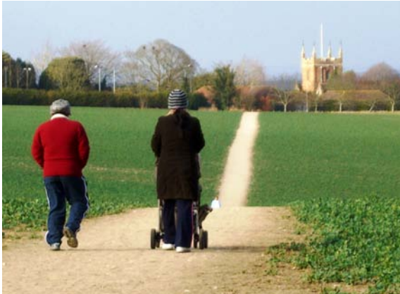
FOOTPATH FROM RAF ODIHAM

Public footpaths are widely recognised as a prime asset of the community and are much used for recreational walking. They also serve as the shortest way between various parts of the Parish, as most residential areas, schools, shops and services are at no great distance from each other. Footpaths linking Odiham High Street and North Warnborough through the Deer Park offer a welcome alternative to the B3349; this can also be avoided to the south by the paths between RAF Odiham and the village.