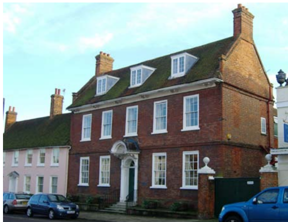
HIGH STREET, MARYCOURT

Almost all buildings in the parish are relatively low with few buildings exceeding two storeys (excluding roofspace). Considerable variations in height occur where floor to ceiling heights are restricted or more generous.