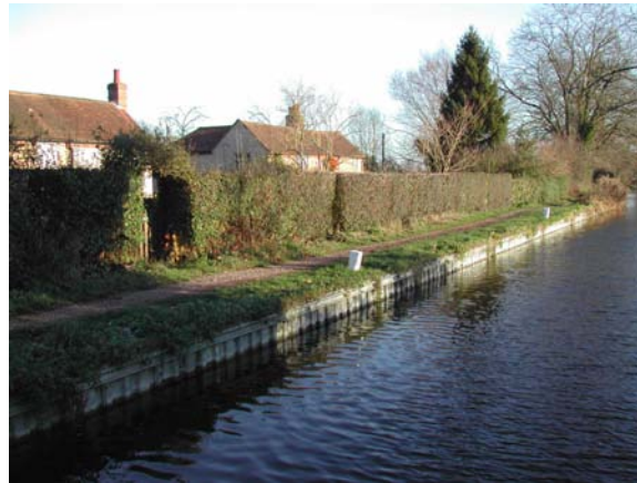
THE CANAL FROM THE SWING BRIDGE

Through traffic and deliveries or collections by larger vehicles compound the issue, particularly in historic areas. Because such access is generally unrestricted, potential problems should be foreseen in the design of all new buildings and redevelopment.