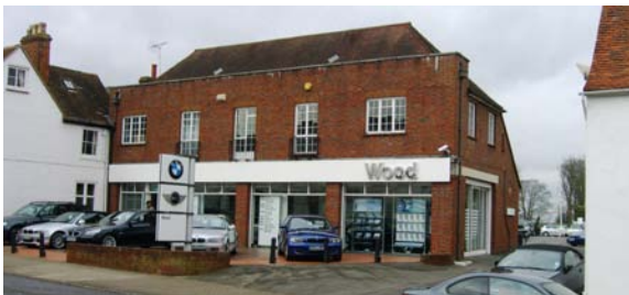
HIGH STREET GARAGE

Mid-way along the High Street is a garage forecourt with glass-fronted showrooms set back that continue towards the Deer Park. The building is out of sympathy with its neighbours, but being set back makes it more acceptable. However, this is a large operation with many related vehicle movements. It challenges the otherwise well-integrated High Street mix of commercial and private premises.