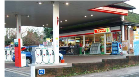
SHOP AND FILLING STATION

Just over the canal bridge, the shop and filling station represent a busy, if uninspiring village resource, after which a sense of spaciousness prevails with alternating green spaces and small groups of houses.