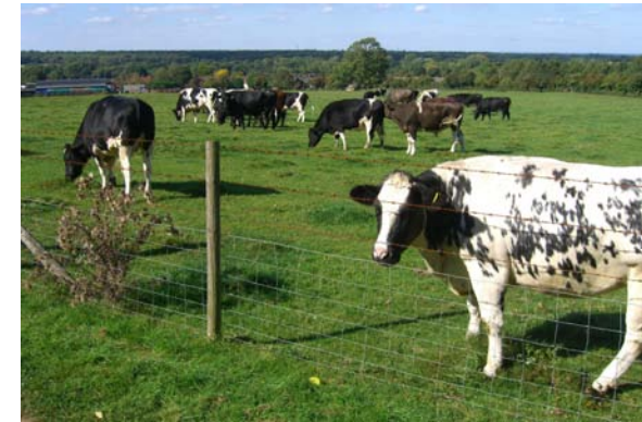
FARMLAND IN THE ODIHAM - NORTH WARNBOROUGH GAP

Farming has had a major influence on the characteristic landscape around the settlements of Odiham. Farmland continues to constitute the largest part of adjacent open countryside; close to all residential areas and easily accessed via a network of footpaths that enjoy long-established views across open fields.