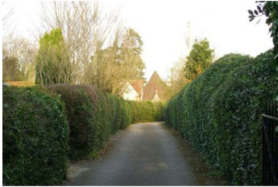
MIXED HEDGES: CEMETERY

Of the many varieties of cupressus, the leylandii is one of the most ubiquitous. But if growth is not kept in check, one person's privacy can lead to another's loss of light.