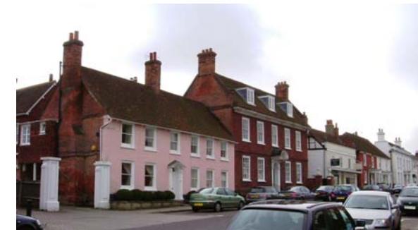
HIGH STREET PRIVATE HOUSES

Roofs are generally steeply pitched with ridges parallel to the road and eaves overhanging the pavements or with parapet gutters. Locally-made red plain clay-tiled roofs predominate, but there are examples of Welsh slate. Rooflines vary considerably, most have gables or, less commonly, hipped ends perpendicular to the road. Tall chimney stacks are a major feature of the roofscape.