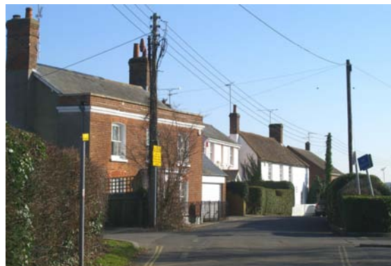
BURYFIELDS HOUSES WITH STREET CLUTTER)

South of the almshouses is the Cottage Hospital and then Buryfields with its school. These Victorian and Edwardian buildings are larger and further apart than those nearer the village centre. A row of houses in Buryfields, from different periods, face fields over a small car park towards the tennis and bowls clubs. The whole area has a very open feel.