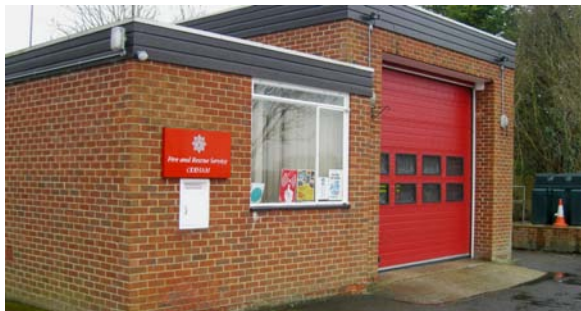
ODIHAM FIRE STATION

Odiham, North Warnborough and, to a lesser extent, RAF Odiham developed when most local people lived and worked in the parish or nearby. This led to a locally focused, cohesive community; as demonstrated, for example, by Odiham's retained fire fighters.