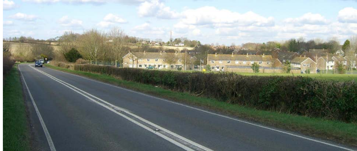
RAF ODIHAM FROM B3349

Houses are well spaced, density is relatively low and appearance is typical of residential accommodation for service families. Trees among the buildings help to soften their impact.