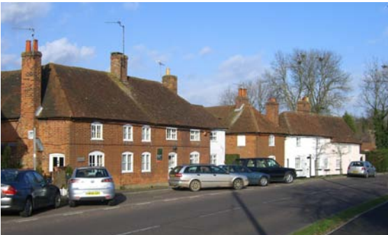
FARNHAM ROAD: TIMBER FRAMED HOUSES. BRICK CLAD Many brick walls have been subsequently rendered or colour-washed, but a good number still reflect the colour and quality of the products from the local kilns. Good quality facing brickwork, often laid in Flemish bond continues to be a feature of some of the best work and much remains.

To a very great extent the buildings of Odiham Parish are built of fired clay-brick for walls (and very fine chimney stacks) and plain tiles (with earthenware ridge tiles) for roofs. Many timber-framed buildings survive, often with later brick facades on the main street elevations.