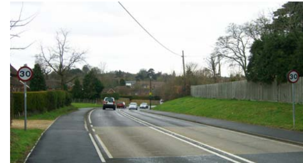
ODIHAM FROM THE FARNHAM ROAD

Most initial impressions inevitably arise from travel, whether by car or other means. The A287, B3349 are key routes into and out of the parish, giving access to The Street at North Warnborough and Odiham High Street.