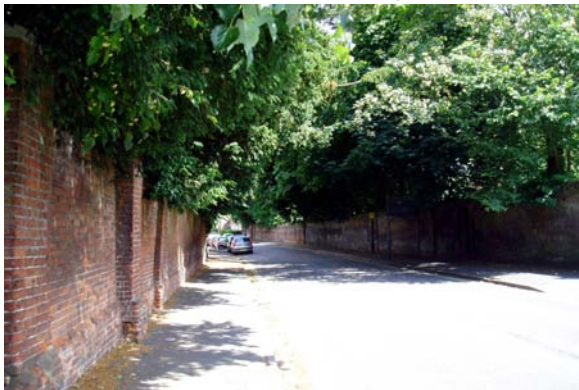
HIGH STREET FROM WESTERN CROSS

Buildings at the western end of the High Street between Western Cross and Palace Gate mainly comprise of detached houses with gardens surrounded by high brick walls that edge the road. Mature trees often overhang the pavement.