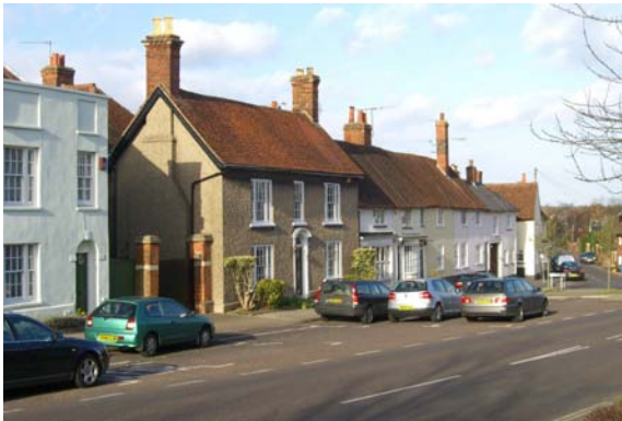
ODIHAM HIGH STREET: ANYTHING BUT BLAND

The parish is distinctive in having retained a built environment developed over previous centuries, sometimes with little respect for the concept of a building line. In North Warnborough, Castlebridge Cottages and shorter terraces were built to a line, but much of the character derives from haphazard development. In Odiham High Street, while the line is consistent, the perspective is anything but bland; the wide street, variety of buildings and many gaps provide the character that helps identify 'Odiham'.