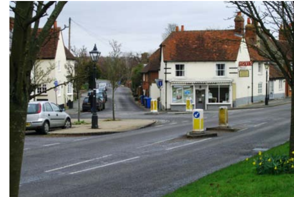
JUNCTION OF LONDON AND FARNHAM ROADS

Where the cottages stop abruptly on the north side development continues with two storey semi detached houses, built by the local authority in the 1950s as Coronation Close. Opposite is a single storey telephone exchange.