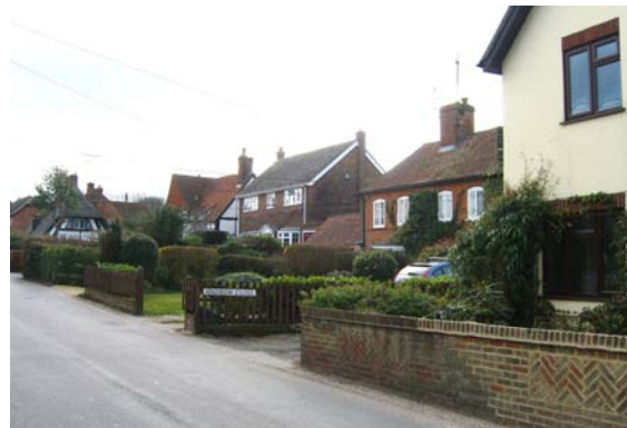
VARIATION: THE STREET

a mix of two and single-storey homes, generally well-spaced so that the gaps provide as much character to the estates as do the houses themselves.