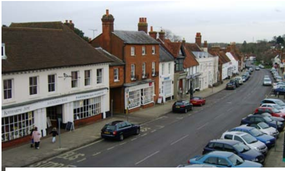
ODIHAM HIGH STREET