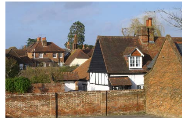
CONTRAST AND VARIETY

It is often the relationship between adjoining or neighbouring buildings that provides balance and harmony to the larger group. This does not preclude contrast in roof heights, which can work well. Similarly, although most buildings have greater width than depth, some have the opposite, providing contrast and variety.