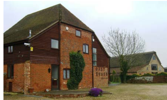
STAPLEY MANOR BARNS