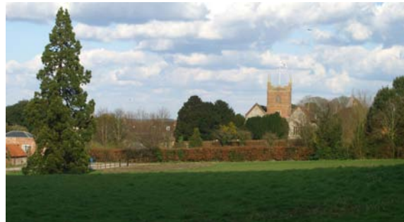
ALL SAINTS CHURCH FROM THE ALTON ROAD

The parish comprises three principal areas of population and several small hamlets set in the surrounding countryside. All are separate and distinctive, with the green spaces between them reinforcing the identity of each community. Each settlement's architecture and housing mix contributes to this sense of identity.