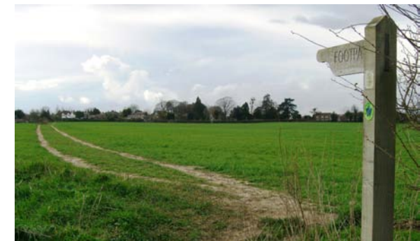
FOOTPATH FROM HILLSIDE TO ODIHAM

Views into and out from the parish are very important, especially from the footpaths that criss-cross it and the main roads that pass through. The canal is a particular feature; its towpath is a prime asset for walkers and is only a few minutes walk from most parts of Odiham and North Warnborough.