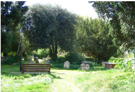
ALL SAINTS CHURCHYARD

The sweeping High Street, widening towards the Farnham end, is seemingly unchanged through several centuries as the major retail centre of the parish. It represents a successful combination of historic setting supporting modern life, shopping and business.