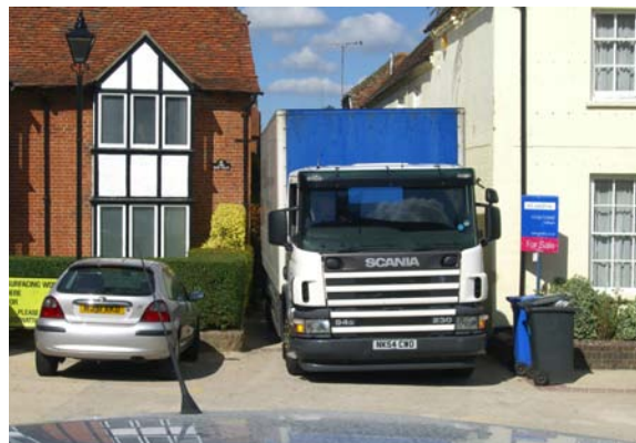
DELIVERING TO THE CO-OP

The Bury to the north of All Saints Church is the most significant enclosed space in the Parish. Home to town fairs from the 15 th century, the stocks are still there, although moved by a few yards from outside the Bridewell, the original prison.