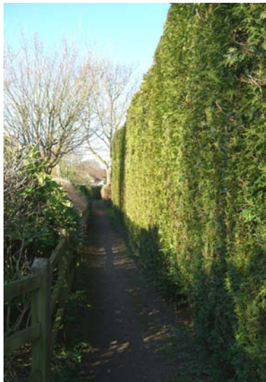
PRIVACY AT A PRICE

Hedge heights can be controlled in parts of the conservation areas and recent legislation offers help with over-shadowing, but this is a difficult, time-consuming subject for neighbours and the council.