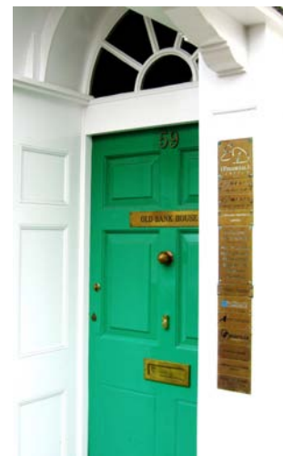
HIGH STREET BUSINESSES

A strong local feature is the commercial use made of barn conversions and the space above shops, contributing to a vibrant mixed community.