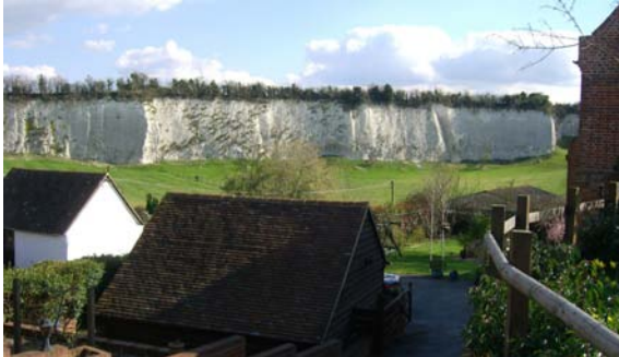
THE CHALK PIT

Prisoners were housed here during the Napoleonic wars and airships in World War I.