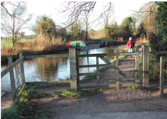
THE BASINGSTOKE CANAL

The River Whitewater provided power for mills and fed hatcheries supplying trout, crayfish and pike.