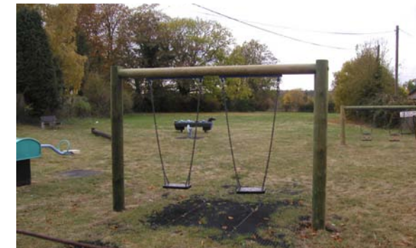
NORTH WARNBOROUGH, RECREATION GROUND

The three schools in the Parish have adjoining playing fields and there is a recreation ground to the west of the Alton Road; also play areas for children near the main residential estates and at Odiham Wharf. Open land runs right up to settlement boundaries on all sides.