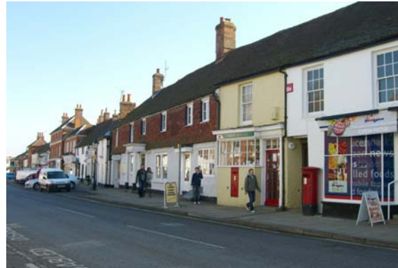
HIGH STREET SHOPS

Retail outlets, including a Post Office and Co-op, represent a core amenity that is synonymous with the character of Odiham.