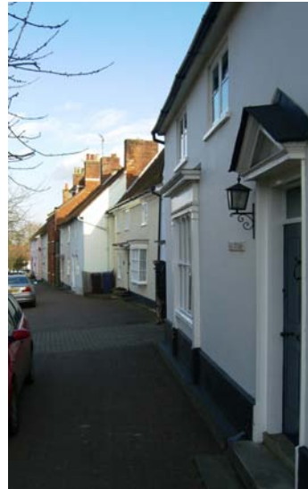
HIGH STREET. FORMER COTTAGES

Most buildings in the parish present their longest elevation (width) to the highway, and are of limited depth. There are many terraces, some of which remain as such whilst others are now single dwellings as result of the amalgamation of two or more small cottages.