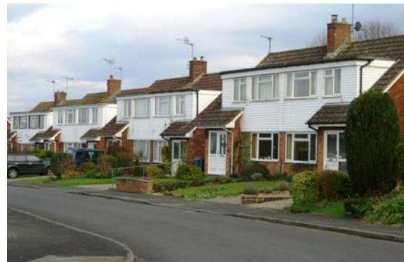
REPETITION: LAUREL CLOSE

The layout of some post-war developments sought to offer a sense of open space through large gardens, but subsequent fences, high hedges and large extensions often detract.