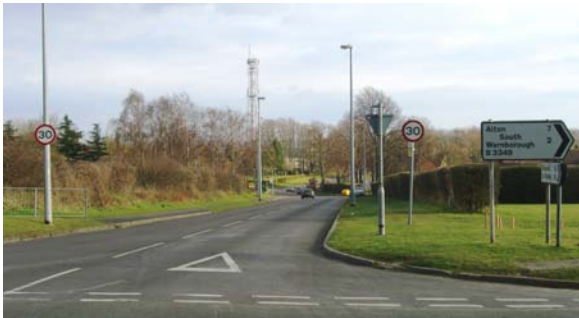
ENTRANCE TO RAF ODIHAM

RAF Odiham is a large station to the south of Odiham which, as well as comprising an airfield with its associated hangars etc., has a housing estate of some 400 homes dating to the 1950s and 60s for RAF personnel. It makes a considerable contribution to the economy and life of Odiham, particularly through the number of children attending the schools.