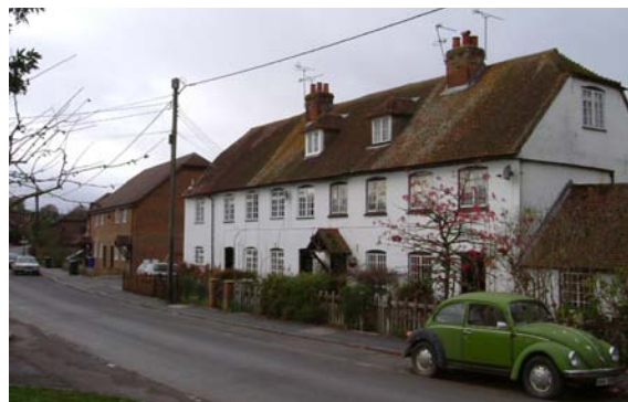
COLT HILL. ALBERT COTTAGES

Roof form is a key feature. Most buildings in the parish have pitched roofs, with the ridge parallel to the highway, although many are half-hipped and some are hipped. Some are broken by dormer windows, which tend to be relatively small and few.