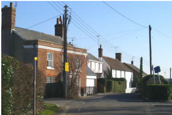
BURYFIELDS HOUSES WITH STREET CLUTTER)

However, overhead cables often detract, with a profusion of signs, road markings and street furniture in recent years, primarily resulting from Hampshire County Council following national standards of standardised design. This has resulted in intrusive and out of keeping clutter detracting from the appearance and character of parts of the parish. Examples include Odiham High Street and the Buryfields/South Ridge road area, and The Street, North Warnborough.