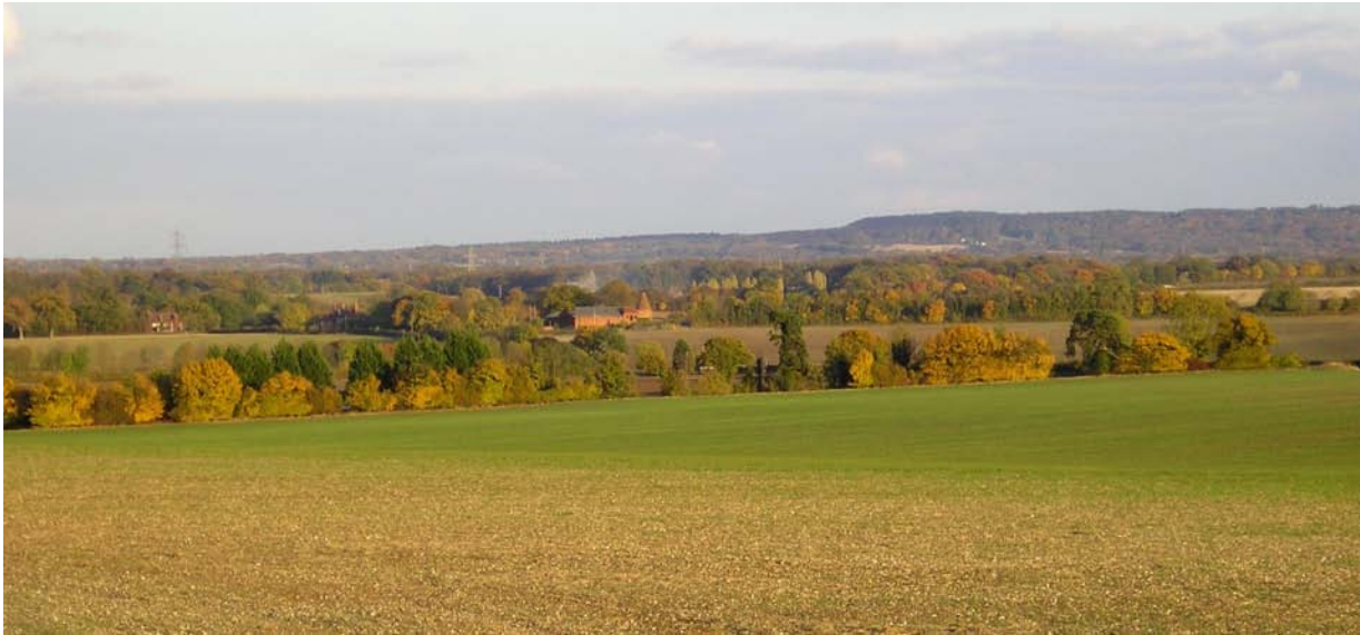
HILLSIDE FARM FROM LONG LANE

Additionally, diversification brings scope for designers to improve and enhance dilapidated buildings in farmyards. The sympathetic conversion of redundant farm buildings to other