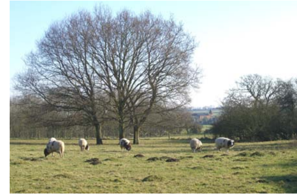
FROM FARNHAM ROAD: JACOB SHEEP AT HATCHWOOD

The community values the views into and out of Odiham's traditional spaces, gaps and footpaths, particularly where there is no vehicular intrusion. The use of country lanes in the area by pedestrians and cyclists is to be encouraged. Developments leading to high levels of use by HGVs should be controlled.