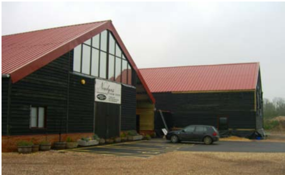
NEWLYNS FARM SHOP

uses, including offices and storage buildings, can complement and sustain farming practices and provide accommodation to support new local businesses - as successful examples have