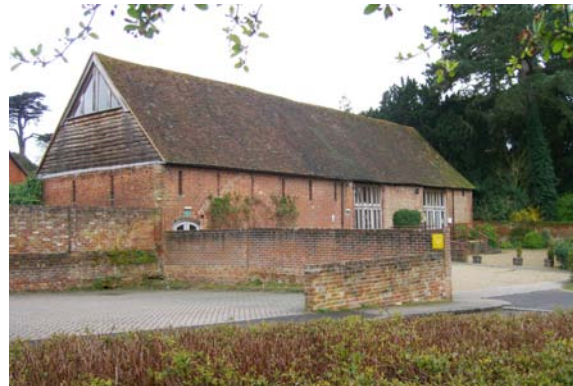
THE CROSS BARN

Local employment is desirable as it contributes to the sustainability of the community; especially the smaller enterprises that have helped shape Odiham's character over previous centuries. The farm buildings of Hatchwood Place, now business premises, and the Cross Barn as a community hall are examples of how historic buildings can be adapted for today's needs.