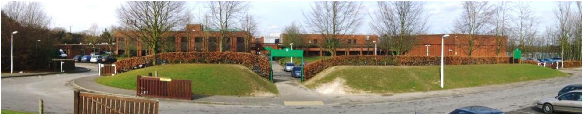
ROBERT MAY'S SCHOOL

In the 1980s a major private development estate was built off Robert May's Road to the south. Opposite, sloping down towards North Warnborough, is Robert May's School. This area has an open feel, with farmland, school playing fields, some houses in large plots and a recreation ground.