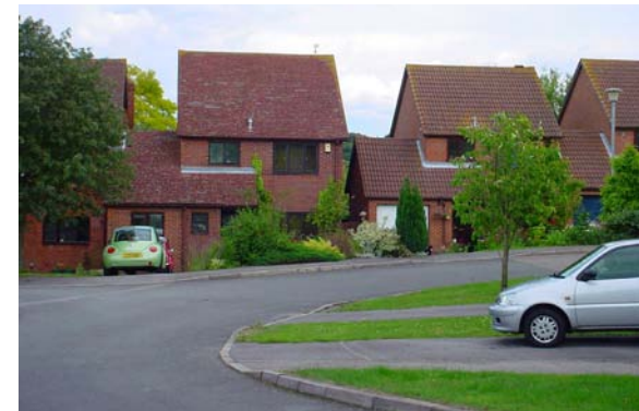
HOUSING: ROBERT MAY'S RSTATE

Some courtyards, and higher-density residential layouts such as in the area of Robert May's Road, successfully incorporate communal areas of grass and trees, with smaller private gardens. This can help such developments retain their intended appearance, thanks to limited options to make use of permitted development rights for unregulated extensions; although car-clutter remains an ongoing problem.