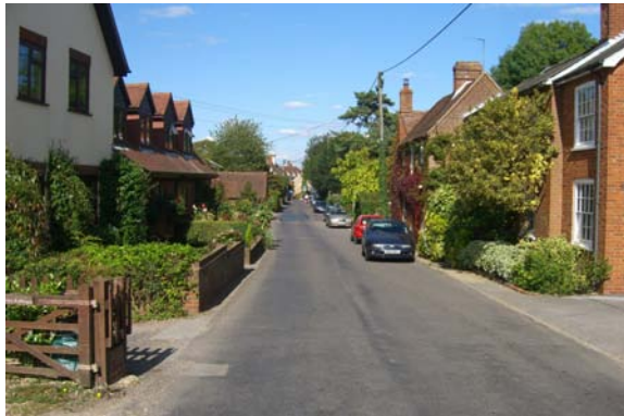
THE STREET NORTH WARNBOROUGH

North Warnborough is a settlement of over a thousand people with a homogenous character of its own. It is separated from the Odiham settlement to the south east by a 'local gap' under planning policy, with open fields and the grounds of Robert May's School between.