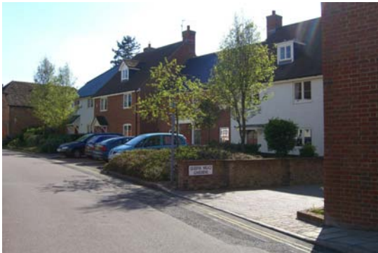
QUEENS MEAD GARDENS

Sustainable development seeks to secure high living standards while protecting and enhancing the environment; preserving finite resources by reducing consumption through the design of economically efficient buildings in harmony with the environment and the community. Good design should pursue these goals locally to protect the prosperity and quality of life of future Odiham generations.