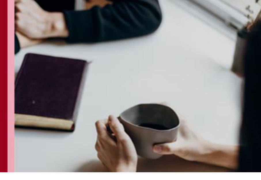
Issue 45 January 2025

The newsletter from Hart District Council